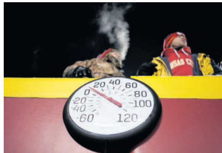
A gauge displays the temperature on the field at Arrowhead Stadium during the first half of an NFL wild-card playoff football game between the Kansas City Chiefs and the Miami Dolphins, Jan. 13, 2024, in Kansas City, Mo.